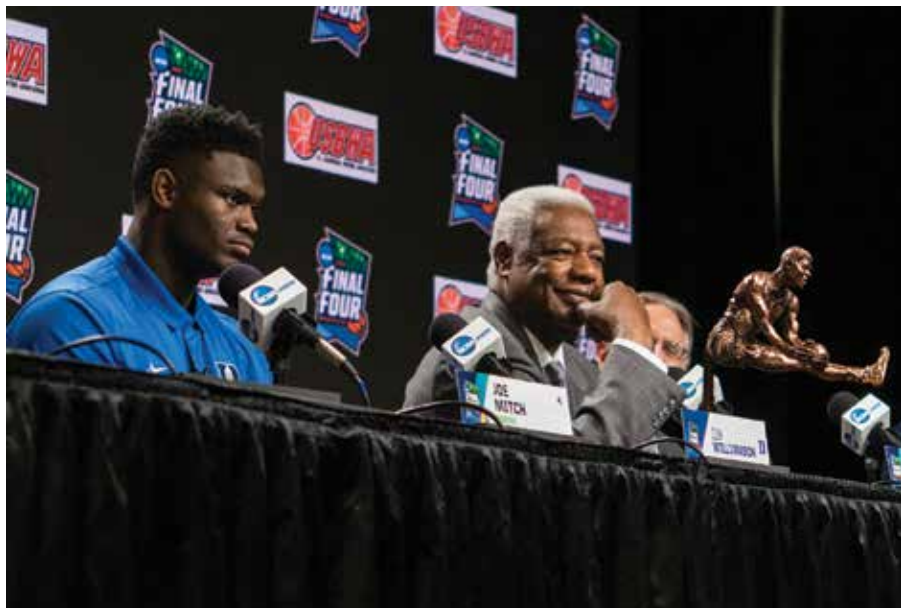
Zion Williamson is awarded the Oscar Robertson Trophy, with Oscar himself.