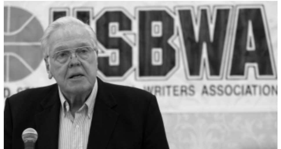
Ex-Oklahoma A&M star Bob Kurland entertained writers at the Monday morning breakfast.