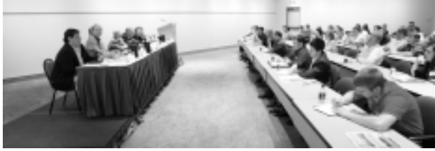
The USBWA writing seminar played to a large crowd.