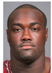
Hudson Florida St.