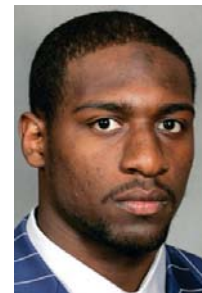
Barnes Bowling Green