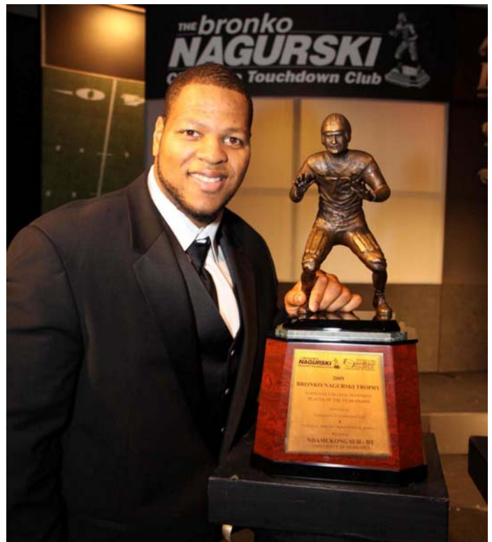
Ndamukong Suh, Nebraska

“When you look at Suh, you see a player who can dominate a game,” Texas coach Mack Brown said. “That defensive front is as good in the country. He is as good as any player in America. He is unbelievable. We have enjoyed watching him play. You look at their film and he is amazing player. You don’t expect that someone so big and so fast, to be over 300 pounds and be as fast as he is. It is amazing.”