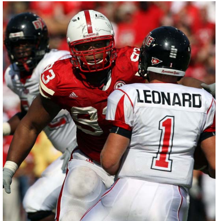
Nebraska's Ndamukong Suh

During the 2009 regular season (including the Big 12 title game) Suh led Nebraska in tackles with 50 unassisted and 32 assisted. He had 23 tackles for losses (12 sacks for 77 yards in losses), 10 pass breakups, 26 quarterback hurries, one interception, one forced fumble and three blocked kicks.