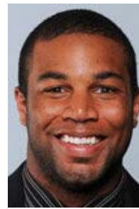
Tate Notre Dame